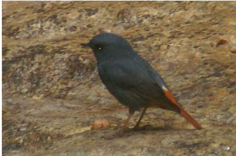
Plumbeous Water Redstart Rhyacornis fuliginosa male