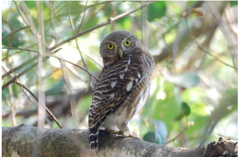
Asian Barred Owlet Glaucidium cuculoides

Near the lake at the back, I came upon a handsome male Hainan Blue Flycatcher (lifer) perching quietly on a branch and a Red-throated Flycatcher (lifer).