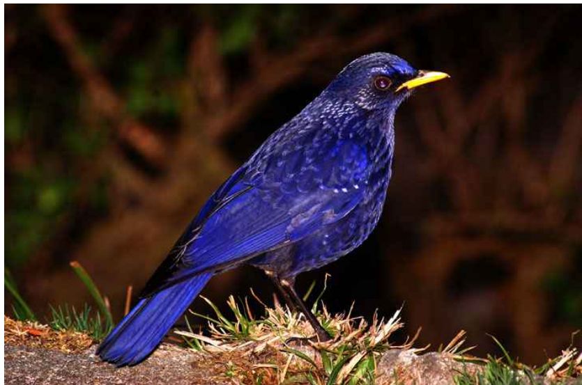
Blue Whistling Thrush Myophonus caeruleus

We waited in vain for the Rufous-throated Partridge. My next lifer would be the Silver-eared Laughingthrush (a recent split from the Chestnut-crowned Laughingthrush), foraging near the buildings. Dark-backed Sibilias (lifer) announced their arrival with their musical calls.