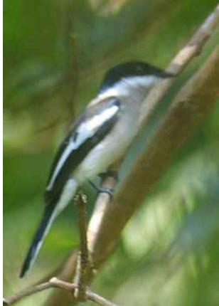
Bar-winged Flycatcher-Shrike Hemipus picatus

On the way back, we came across 3 Puff-throated Bulbuls (lifer) as they moved through the trees, a little White-bellied Yuhina showed up, a male Black-throated Sunbird stopped to preen and a Bar-winged Flycatcher-Shrike hawk for insects from a perch.