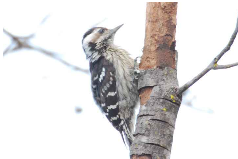
Grey-capped Woodpecker Dendrocopos canicapillus