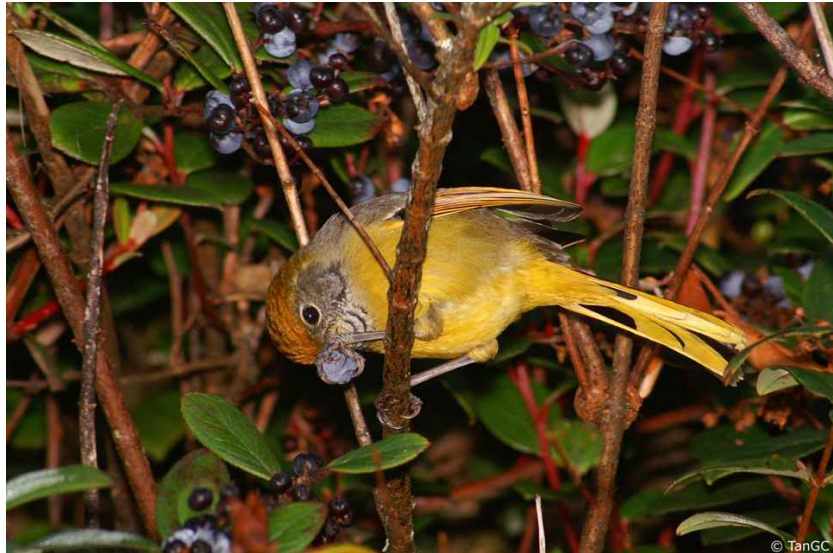
Bar-throated Minla (Chestnut-tailed Minla) Chrysominla strigula feeding on fruits at the summit car park

We stayed till 9:30am but it was still very cold, so we decided to bird farther down the mountain and come back to the Angka Trail another time.