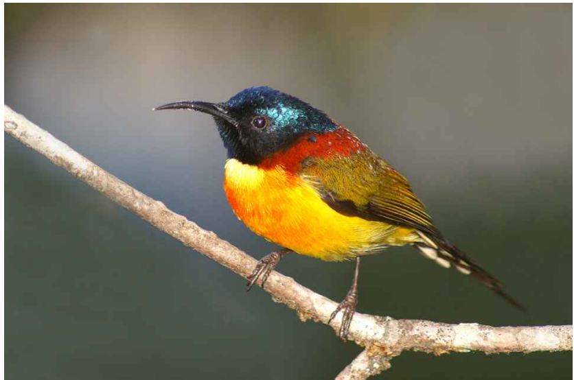
Green-tailed Sunbird Aethopyga nipalensis male

The calls of the Golden-throated Barbet joined in the morning chorus and a mating event was witnessed! As it got light, the endemic subspecies of the Green-tailed Sunbird (lifer) started to appear, and apart from visiting the flowers, 2 males were fighting for the attention of a female.