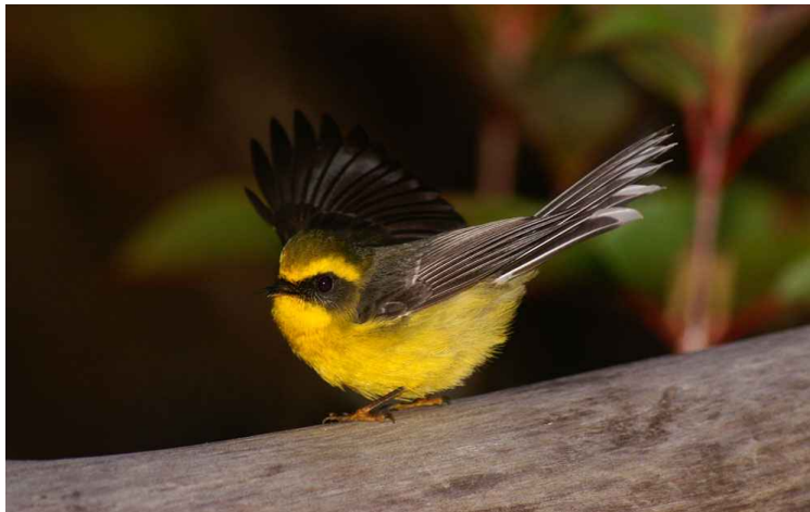
Yellow-bellied Fantail, a denizen of the higher dois