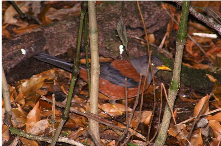
Chestnut Thrush Turdus rubrocanus