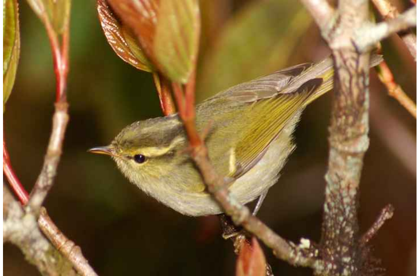
Blyth's Leaf Warbler Phylloscopus reguloides

Proceeding in, a Rufous-winged Fulvetta (lifer) was seen busily clambering on the tree trunks. It was fantastic as it was one of my target birds.