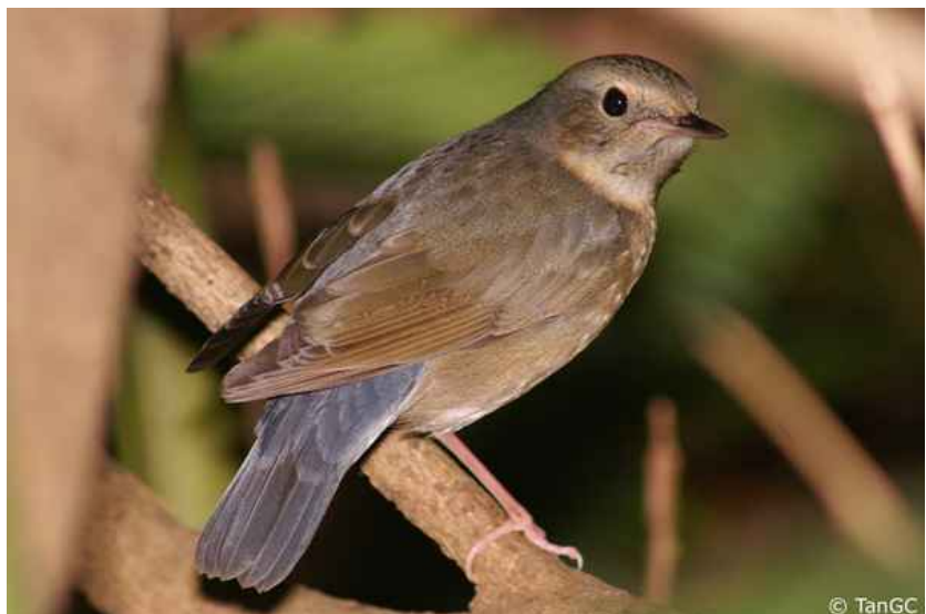
Siberian Blue Robin Luscinia cyane female