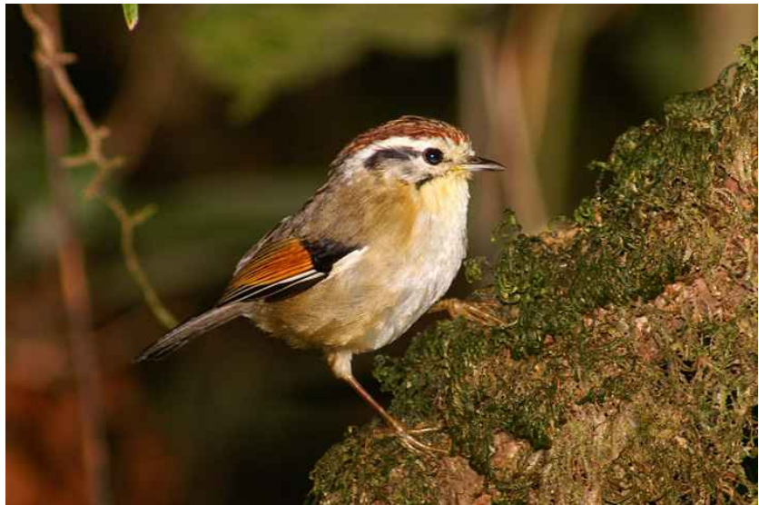
Rufous-winged Fulvetta Pseudominla castaneiceps

Proceeding in, a Rufous-winged Fulvetta (lifer) was seen busily clambering on the tree trunks. It was fantastic as it was one of my target birds.