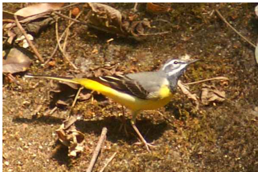
Grey Wagtail Motacilla cinerea

Day 2 We spent half an hour at the falls and located a 1530-1600 Grey Wagtail and a Blue Whistling Thrush Weather: good (resident ssp). We also heard Striped Tit-Babbler and Common Tailorbird.