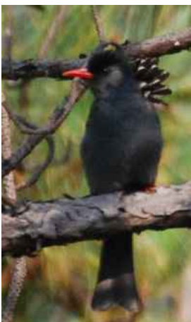
Black Bulbul Hypsipetes leucocephalus

We left Mae Cham Road and turned into the Mae Pan Waterfall Road. Some 1.6km into this road, we noticed bird activity and stopped the vehicle. A Grey-capped Woodpecker (lifer) hopped about on the tree trunks. 2 pretty Black Bulbuls (lifer) perched right on the tree tops. Good thing the land sloped downwards and the birds were just slightly above eye level.