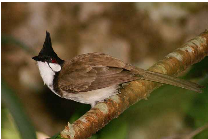
Red-whiskered Bulbul Pycnonotus jocosus

Again we had lunch at Mr. Daeng's relaxing restaurant. It was rather hot and sunny so we relaxed till 3:40pm. The Hill Blue Flycatcher, Blue Whistling Thrush and Siberian Robin were still around. A Red-whiskered Bulbul showed up among the trees.