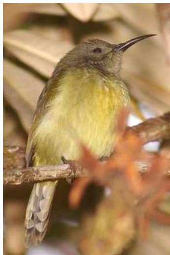
Green-tailed Sunbird Aethopyga nipalensis female note the undertail pattern

There are actually 2 boardwalks near the summit. One leads from the summit car park to the information centre and the other – the AngKa Trail – starts from opposite the information centre and goes in a loop through the montane bog.