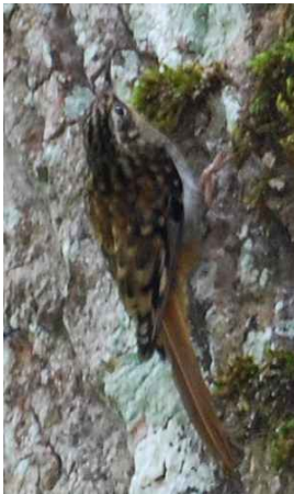
Brown-throated Treecreeper Certhia discolor

Day 2 After lunch, we took a walk along the checkpoint 2 Early Afternoon jeep track. It is not possible to drive along this 1300-1500 track due to treefall. We had good views of a male Weather: good Short-billed Minivet (lifer) at the beginning.