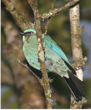
Verditer Flycatcher Eumyias thalassina

A Lesser Yellownape perched high up. Ben saw and photographed a Bay Woodpecker . Flavescent Bulbuls appeared to be rather common. Another lifer came in the form of a Striated Bulbul . Conspicuously, Lesser Racket-tailed Drongos were actively flying about, so were the resident Ashy Drongos (black colour). Mountain Imperial Pigeon flew by, a Verditer Flycatcher came by the roadside and quick moving Dark-backed Sibias foraged in the foliage.