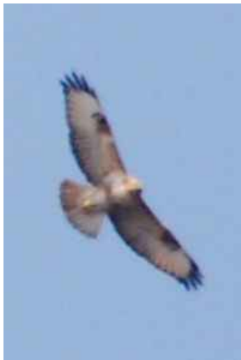
Common Buzzard Buteo buteo light morph

Along a path through the wooded area at the back, we recorded a Black Drongo in first winter plumage, Coppersmith Barbet, Large-billed Crow, Eurasian Tree Sparrow, Sooty-headed Bulbul, Red-whiskered Bulbul and a cheery Hoopoe . A soaring raptor turned out to be a light morph Common Buzzard (lifer).