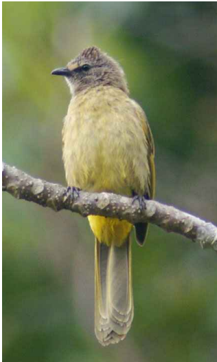
Flavescent Bulbul Pycnonotus flavescens

Day 3 Again, we made an early start for the summit which was fogged out! And again we staked out the partridge which again was a no show! Morning Weather: foggy at summit, clear at km 37.5 0630-0830