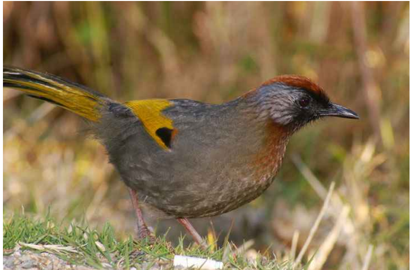
Silver-eared Laughingthrush Garrulax melanostigma

The calls of the Golden-throated Barbet joined in the morning chorus and a mating event was witnessed! As it got light, the endemic subspecies of the Green-tailed Sunbird (lifer) started to appear, and apart from visiting the flowers, 2 males were fighting for the attention of a female.