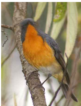
Slaty-backed Flycatcher Ficedula hodgsonii male

We stopped at the first big car park down from the peak. There was a small food stall and toilet facilities here. Down here, the sun was out and soon it was rather warm. It was time to start reducing the layers of clothing! Such is montane birding, we have to adjust our dressing as the temperature changes.