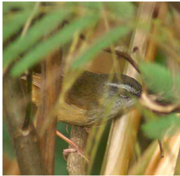
Hill Prinia Prinia atrogularis