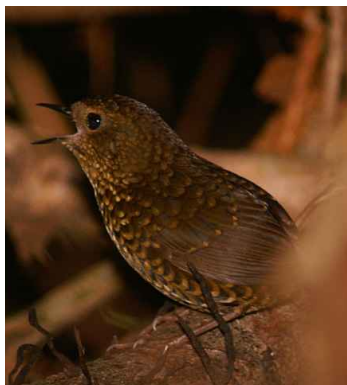
Pygmy Wren-Babbler Pnoepyga pusilla

Then I saw movement on the forest floor and soon was rewarded with views of 2 Chestnut Thrushes (lifer) – mega! The calls of the Pygmy Wren Babbler gave away its presence and the bird was soon located in the undergrowth. A little Yellow-browed Tit (lifer) put up an appearance on the way out of this loop trail and nicely rounded up the Ang Ka Trail's sightings.