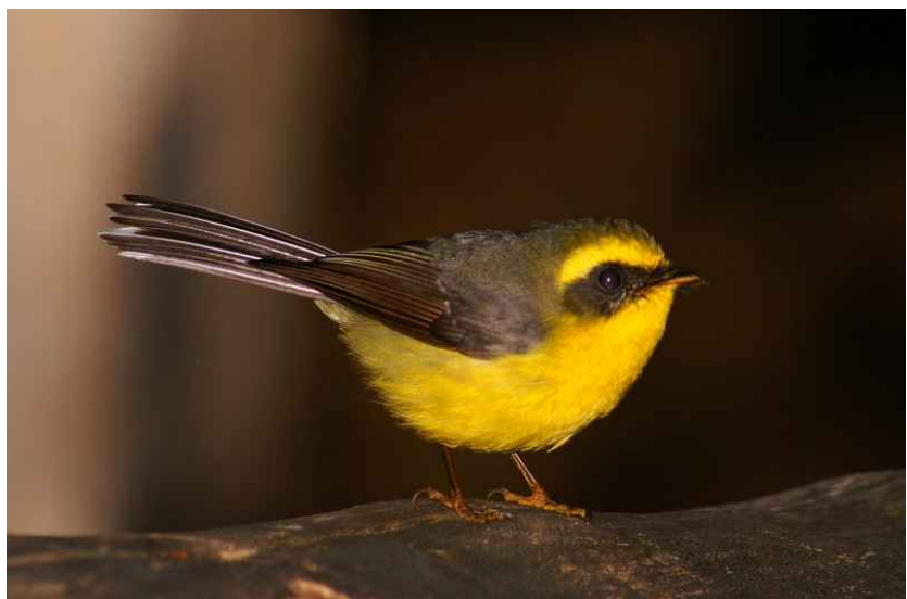
Yellow-bellied Fantail Rhipidura hypoxantha

We went back to the summit to bird the Angka Trail in the late afternoon and recorded the very active and cute little Yellow-bellied Fantail at the open area in light drizzle.