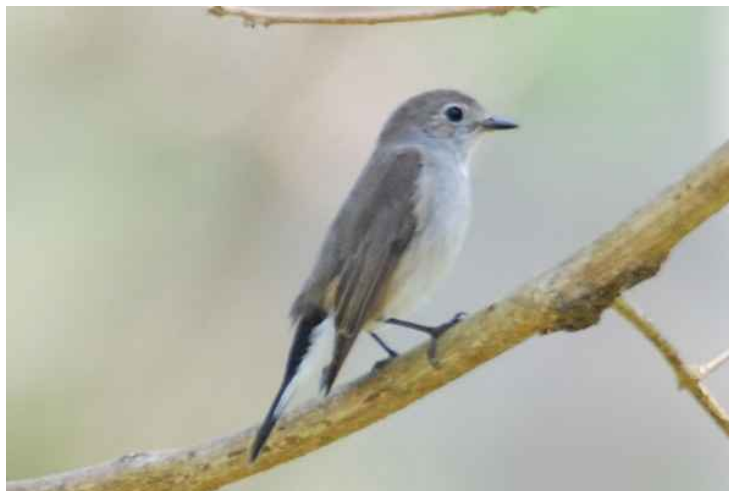
Red-throated Flycatcher Ficedula parva

Near the lake at the back, I came upon a handsome male Hainan Blue Flycatcher (lifer) perching quietly on a branch and a Red-throated Flycatcher (lifer).