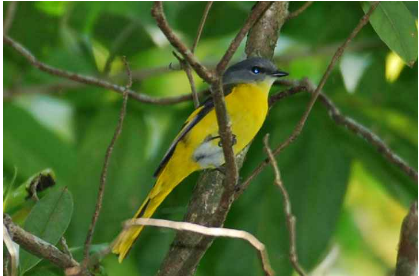
Female Grey Chinned Minivet Pericrocotus solaris