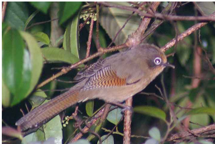
Spectacled Barwing Actinodura ramsayi

We drove down and came to a promising stretch of road about 500m above checkpoint 2. We heard the Large Hawk Cuckoo and saw some birds flying, so we stopped. The Large Hawk Cuckoo called for quite some time but could not be located. A small flock of Short-billed Minivets seemed to check us out from a roadside tree. A beautiful Spectacled Bar-wing (lifer) showed up across the road.